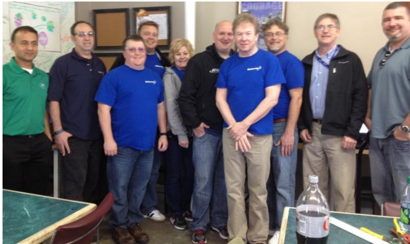
Volunteers from Orbital ATK

Organizations organizing to help organizations. That's a lot of organization-ing, but it seems to be the theme at Meeting Ground this month. We've been so blessed to have many organizations contact us to work on specific projects. ATK and Journey Church worked to create a conference room and renew the program room to make computers available to our guests & residents. Other organizations that have reached out to us this month include local church groups, businesses and civic groups, and we are currently working closely with them to identify more projects and improvements to our facilities.